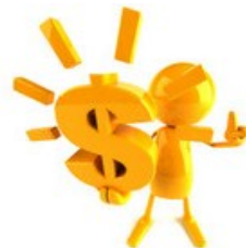
· 43975